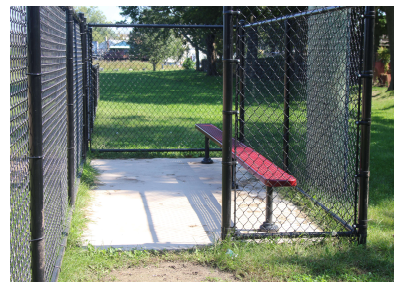
Wabash SG343P ($942) 15' Perforated cranberry/black (no plaque on bench)