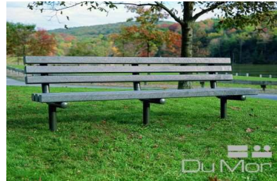
Dumor 11-60PL ($1540)