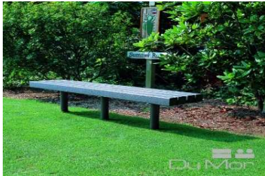
Dumor 105-80P ($1280)