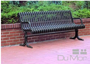
Dumor 140-60 ($2030)

790 Main Street Warren RI 02885 Phone 401-824-4623