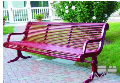
Dumor 141-60 ($2312)